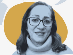
SAMA AWEIDAH WOMEN'S STUDIES CENTRE